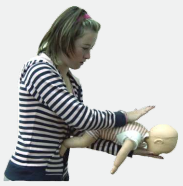
This is one method for infant- if having to act quickly where no seat is available to allow for positioning over the first aiders thigh.

Infant: Back blows - head downwards so gravity will assist with expulsion. Across your lap/thigh or over your arm. Chest thrusts – turn over.